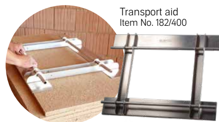
Transport aid Item No. 182/400

Drywall board made of clay for cladding of wood and metal post structures of inner walls, facing shells, ceiling and roof surfaces. The clay building board brings lots of clay into the house, with all the positive effects for the indoor climate, especially in thermal terms. It must be cut with the hand-held circular saw. The Clayboard D 22 provides the walls with a wide drywall substructure grid of 625 mm. As supplement to this product sheet the ClayTec Guidelines for ecological drywalls in system apply.